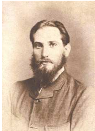
C. W. Leadbeater at Adyar, 1885