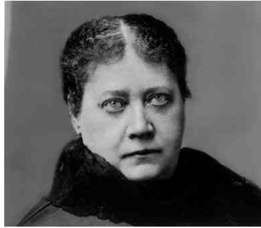
H. P. Blavatsky in London, 1884

Perhaps HPB was not wrong about what she said to the young CWL when she first met him in London, in 1884, after he had written a letter to the spiritualistic journal Light in defense of Theosophy: 'I don't think much of the clergy, for I find most of them hypocritical, bigoted and stupid; but that was a brave action, and I thank you for it. You have made a good beginning; perhaps you may do something yet.'